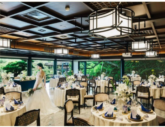
Heian-Jingu Shrine Hall and Room for Reception