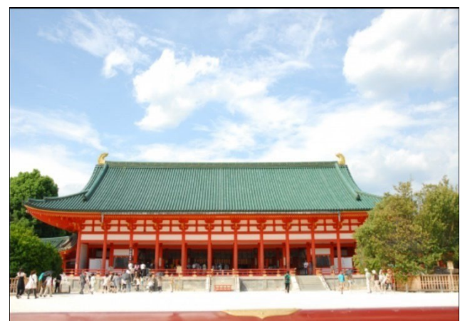
Front Gate of Heian-Jingu Shrine