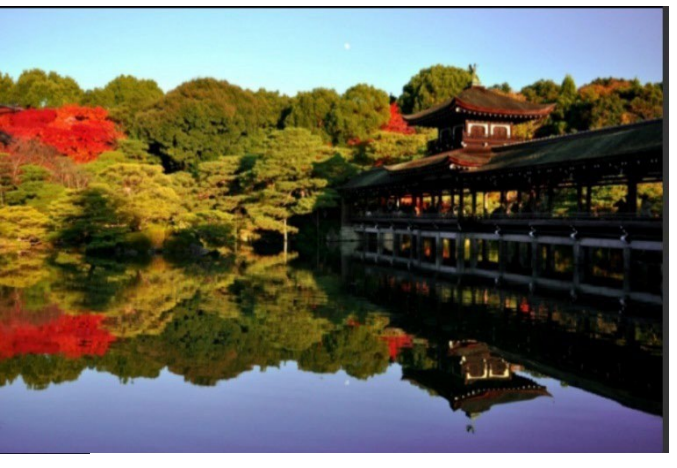
Garden in front of reception building below